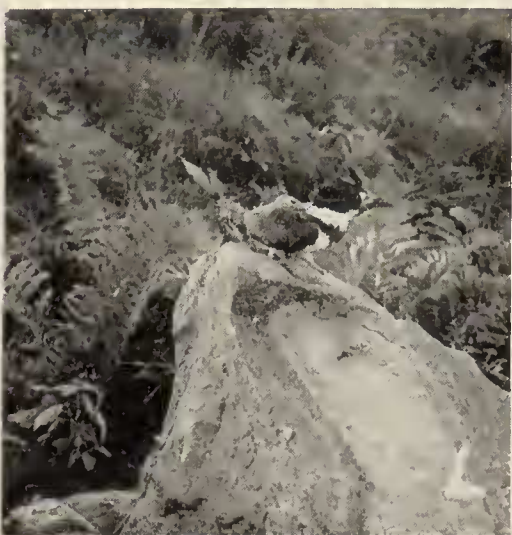
FIG. 4. Belted Kingfisher Nestlings. G, 27 days old; H and I, 28 days old; J, 29 days old; K and L, 31 days old.